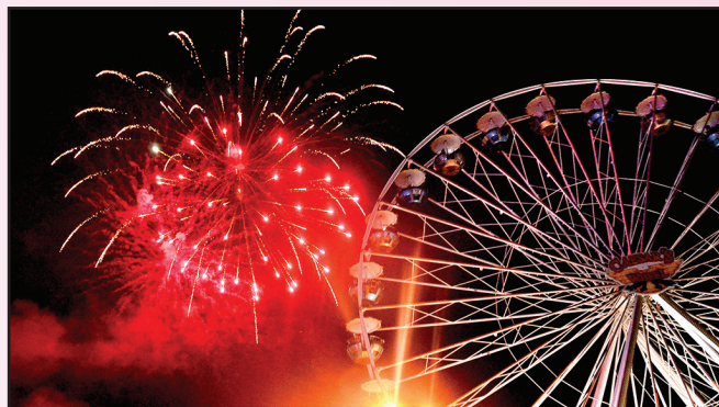
Don't miss the fireworks on the Fourth at the German American Friendship Fest.

six-week-long Boot Camp that will take you from ground zero to hero. Classes meet on Mondays and Wednesdays from 6-7:15 p.m. July 17 to Aug. 23. Cost is $179. Sign up at the Fitness Center.