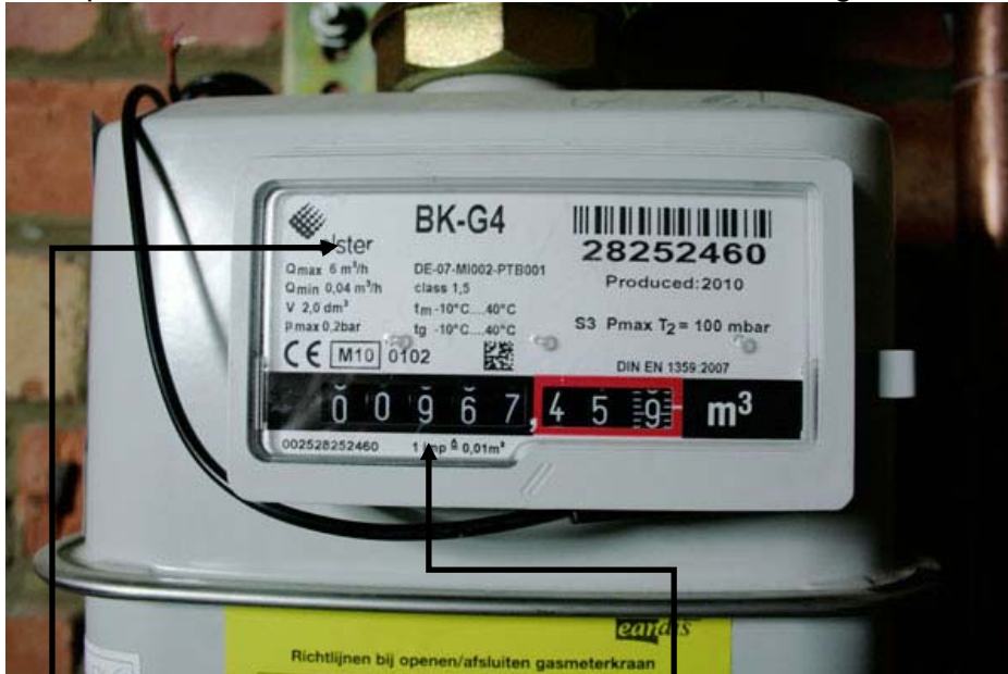
Meter Serial Number

Example of Gas meter: Meter Number: 28252460 reading 967.4m 3