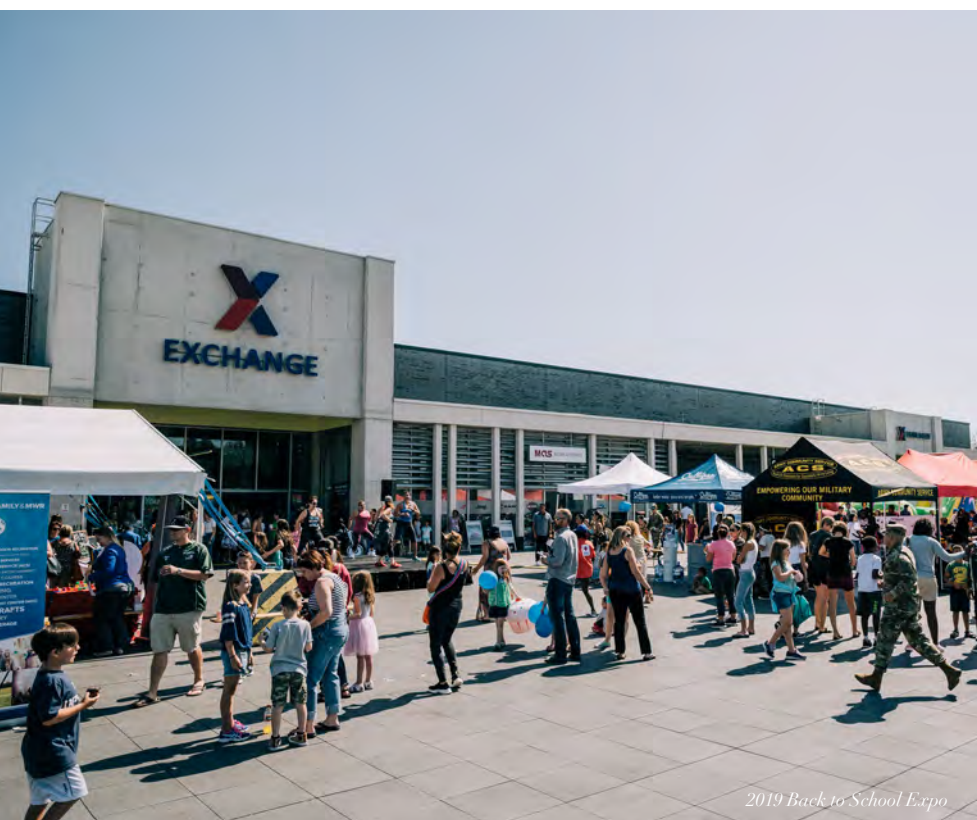
2019 Back to School Expo

This mega event has grown into the community's premier run of the year. It includes a 10-mile run, a 5k run/walk and a ½ mile kid's run. The event is capped off with free food, entertainment and awards! Estimated attendance: 500+