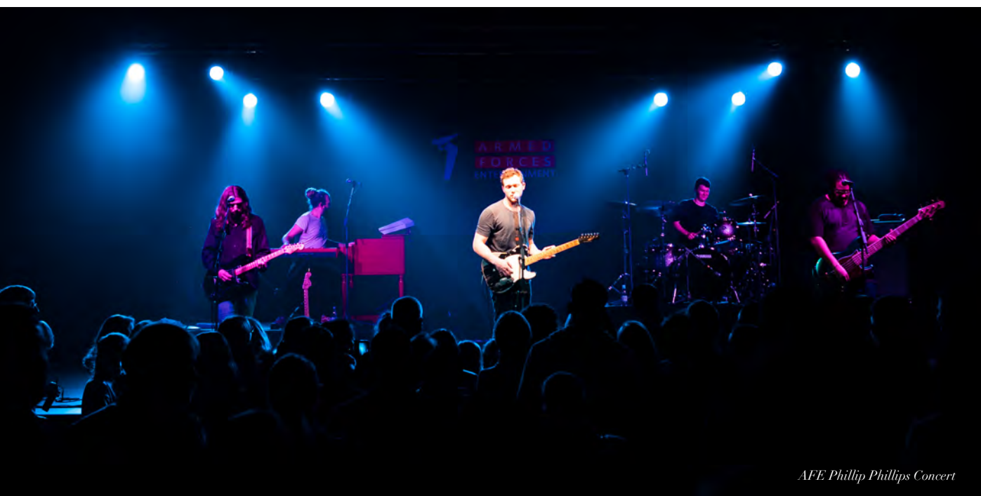
AFE Phillip Phillips Concert