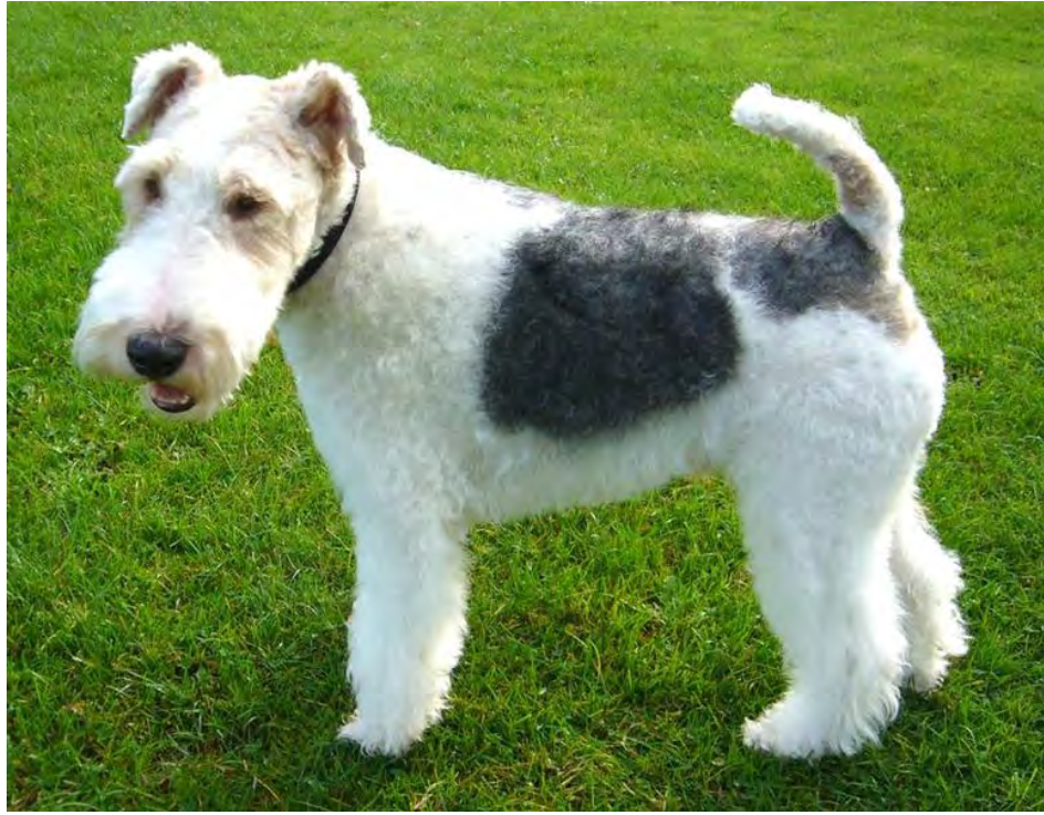
Fox Terrier (Drahthaar Foxterrier)