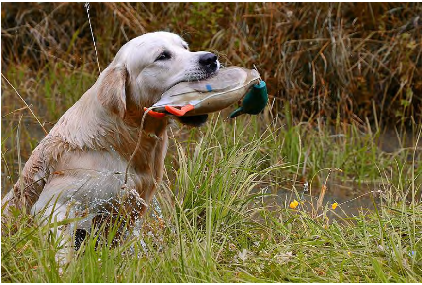
Golden Retriever (Golden Retriever)

The Golden Retriever combines outstanding physical appearance with many qualities that make it a favorite among hunters for waterfowl and upland-game.