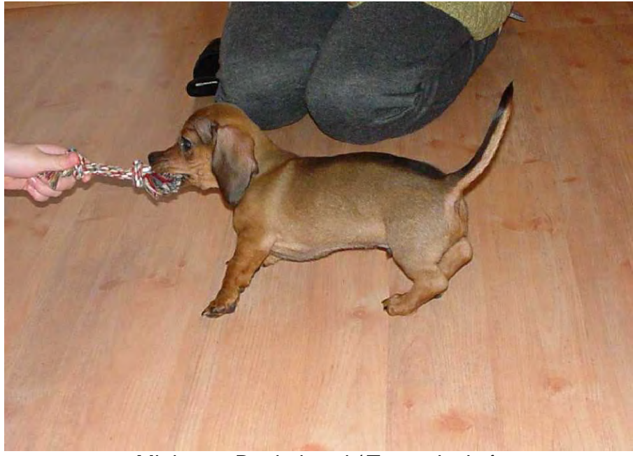
Miniature Dachshund (Zwergdackel)