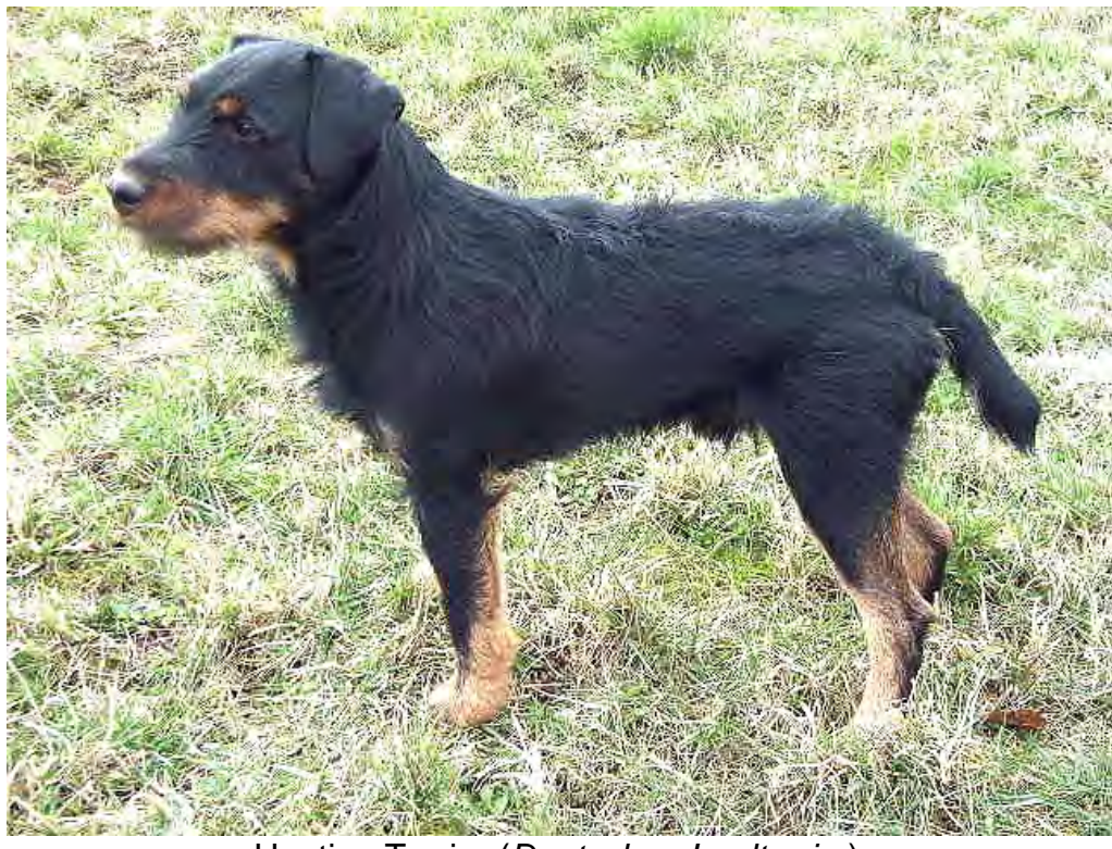
Hunting Terrier (Deutscher Jagdterrier)