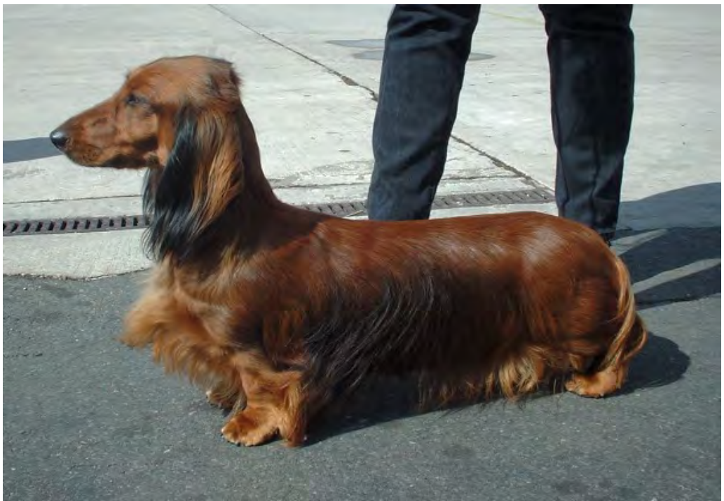
Long Haired Dachshund (Langhaardackel)