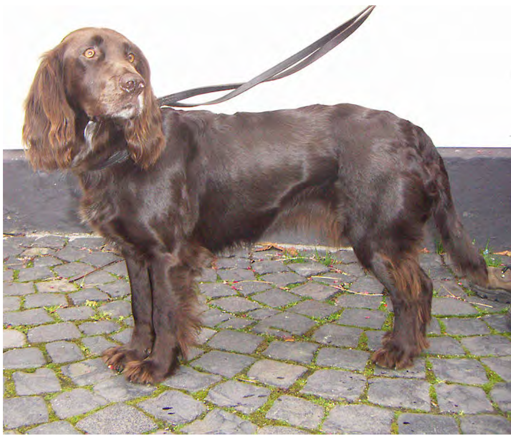
German Springer Spaniel (Deutscher Wachtelhund)