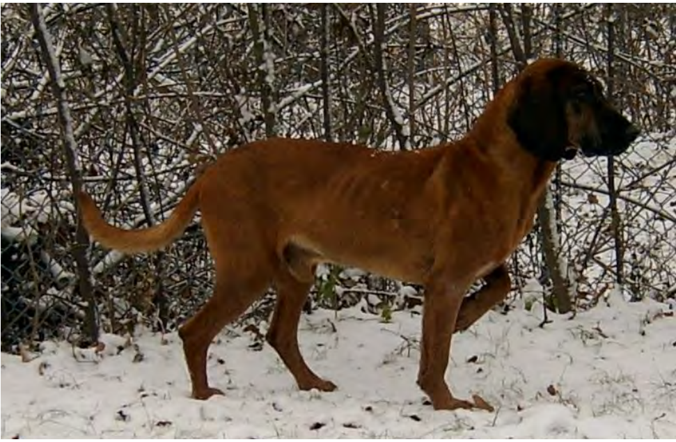
Bavarian Mountain Bloodhound (Bayerischer Gebirgsschweißhund)

Bloodhounds are trained to follow the blood trail of a wounded animal. They are sturdy dogs and built for endurance. This group includes such dogs as the Bayerischer Gebirgsschweißhund and the Hannoverscher Schweißhund .