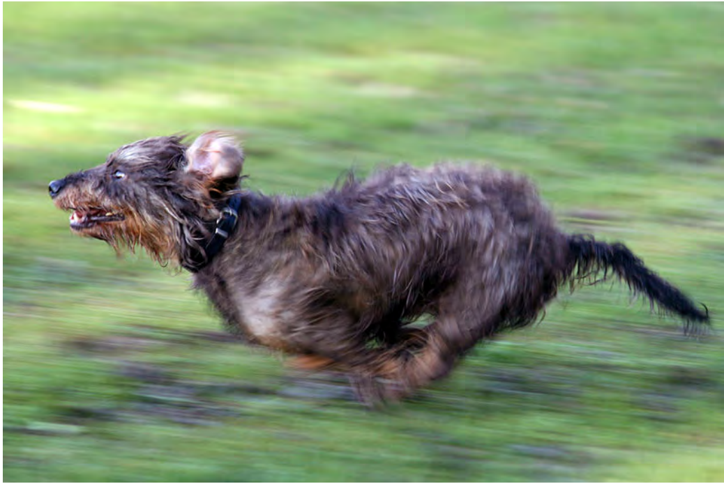
Rough Haired Dachshund (Rauhaardackel)