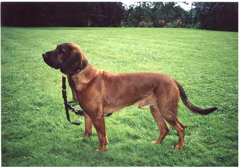
Hanover Bloodhound (Hannoverscher Schweißhund)