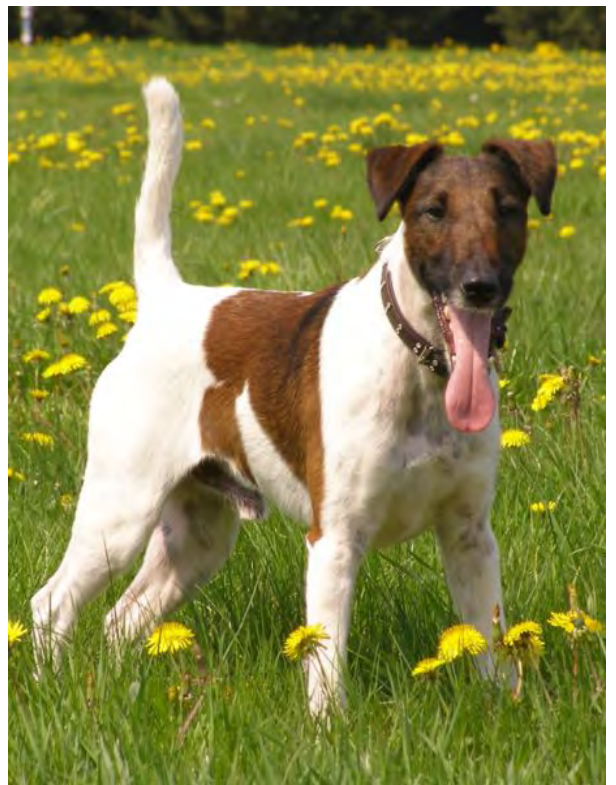
Fox Terrier (Glatthaar Foxterrier)