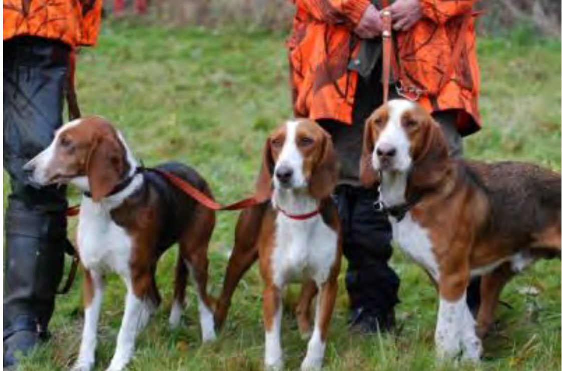
Deutsche Bracke (Deutsche Bracke)