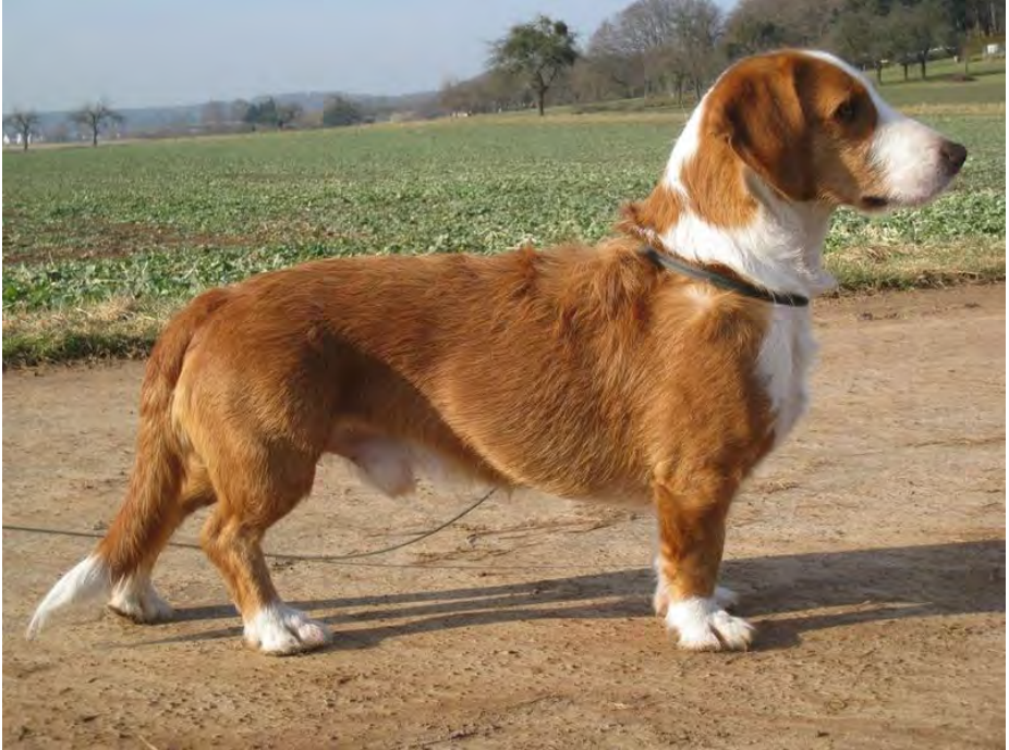
Westphalian Dachsbracke (Westphälische Dachsbracke)