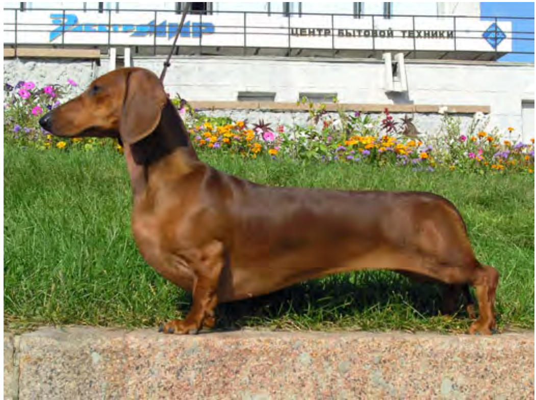
Short Haired Dachshund (Kurzhaardackel)