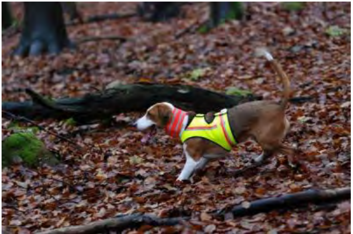
Deutsche Bracke (Deutsche Bracke)