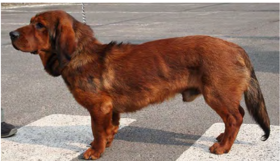
Alpine Dachsbracke (Alpenländische Dachsbracke)

Hounds are the oldest species of hunting dogs. They are used in packs to hunt for hare and fox and are usually kept in kennels.