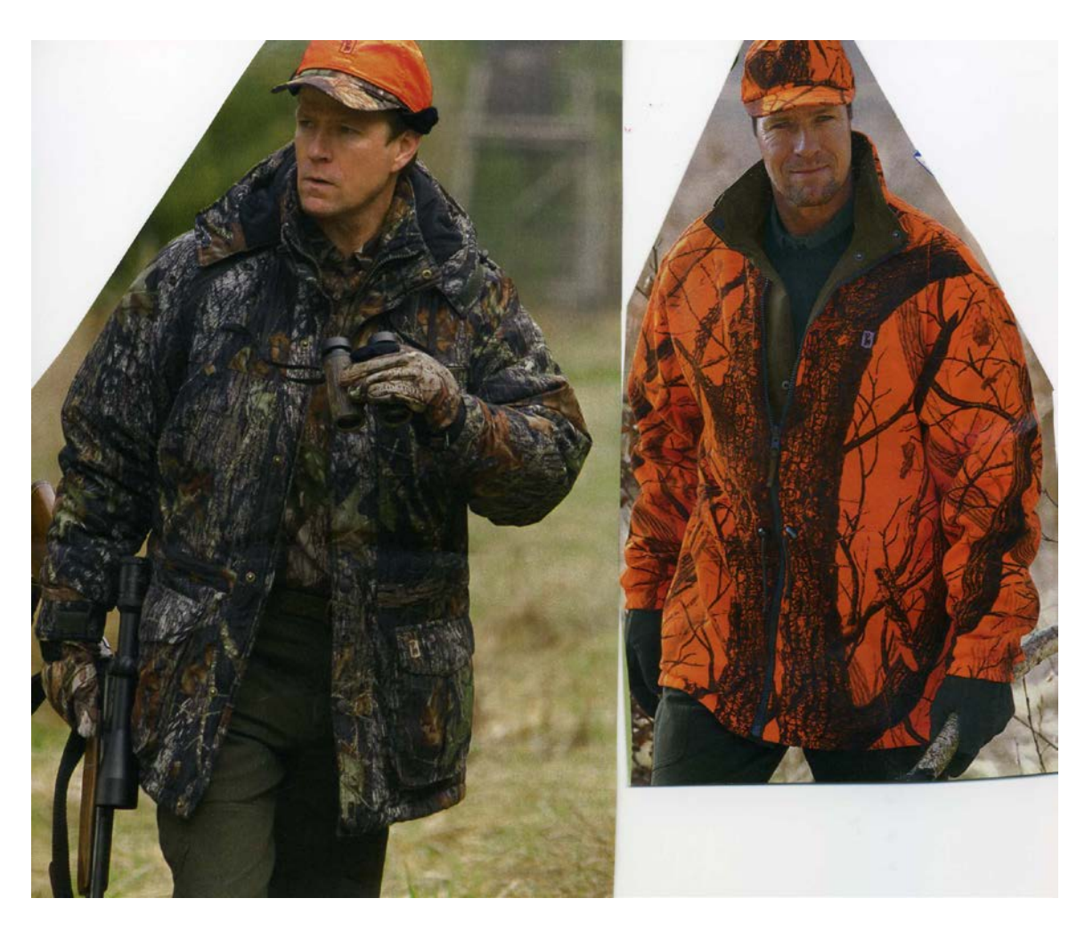
Modern camouflage and warning color